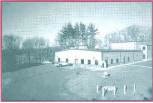
and the health risks associated with any contaminants. Safe water is vital to the community. Please read this report carefully and, if you have questions, call the Bureau of Utilities at 410-386-2164.

Since 1969, water quality has been the primary commitment of Freedom District Water Treatment Plant #1, Plant #2 since May of 2001 and Plant #4 since May 2007.